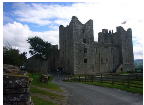
Castle Bolton N Yorks. (see below).

Sun 21 st August 2011 WAMGOC Octagonal Run.