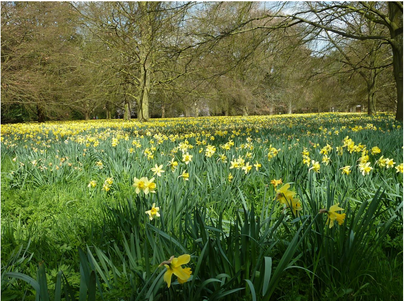
A host of golden Daffodils.