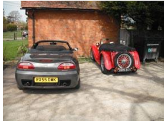
The oldish and the newish meet at the Bell.