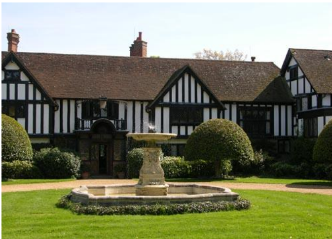
Some went into the house where there are interesting china and pictures to see but we decided to save it for next time and we made tracks towards home.