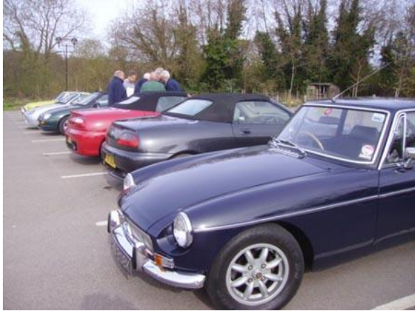
A Wamgoc symmetrical double decker sandwich.

Some twelve cars assembled at the Royal Standard of England for the start at 10 o'clock with the drivers and navigators suitably refreshed with coffee and bacon butties.