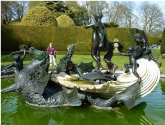
I say, they are almost naked.