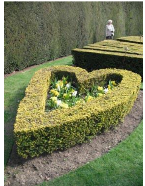
Stan is an old romantic!